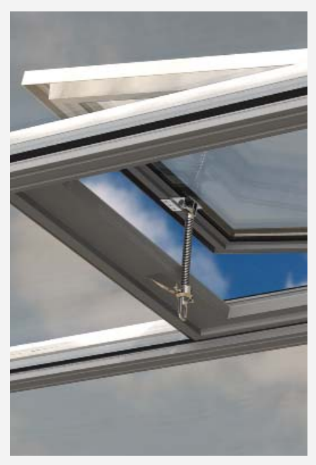
Pole operated screw jack mechanism

Roof vents can be specified with a pole operated screw jack mechanism or you can opt for a full climate control package of rain sensor and thermostat.